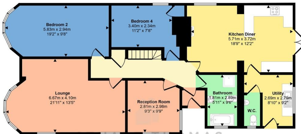
Ground Floor Approx 108 sq m / 1158 sq ft

Approx Gross Internal Area 170 sq m / 1832 sq ft