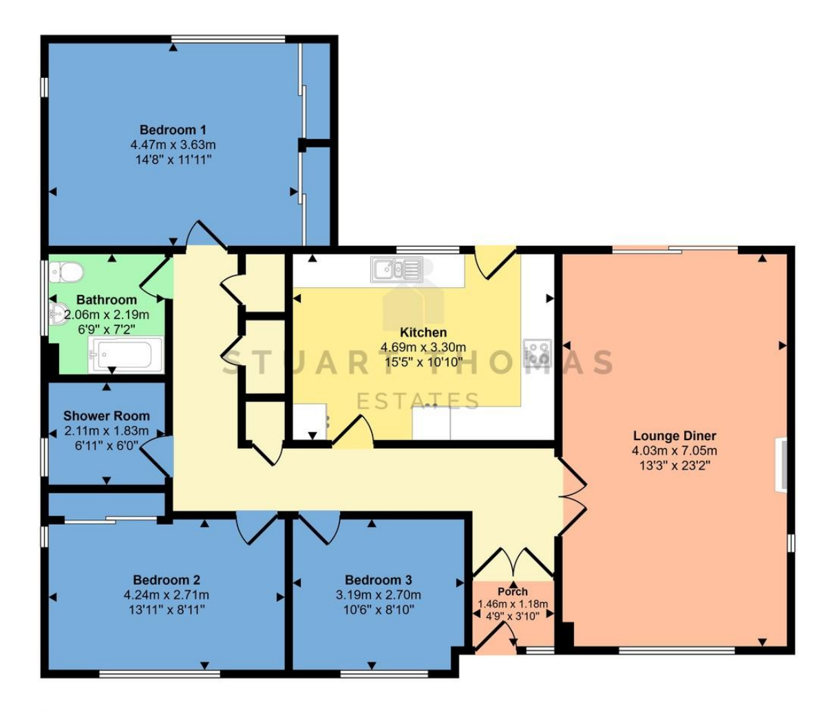
Approx Gross Internal Area 117 sq m / 1254 sq ft