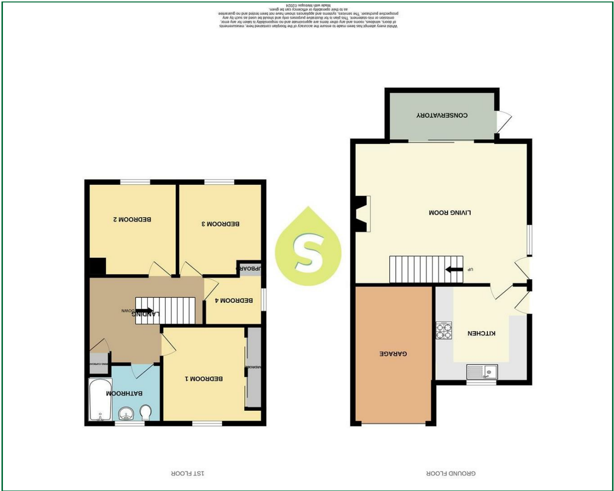
Floor PlanArea Map

Please contact our Sheffield Office on 01462 814087 if you wish to arrange a viewing appointment for this property or require further information.