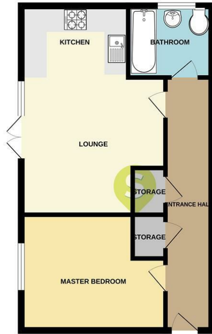
RIVER VIEW - SHEFFORD

Whilst every attempt has been made to ensure the accuracy of the floorplan contained here, measurements of doors, windows, rooms and any other items are approximate and no responsibility is taken for any error, omission or mis-statement. This plan is for illustrative purposes only and should be used as such by any prospective purchaser. The services, systems and appliances shown have not been tested and no guarantee as to their operability or efficiency can be given. Made with Metropix C5024