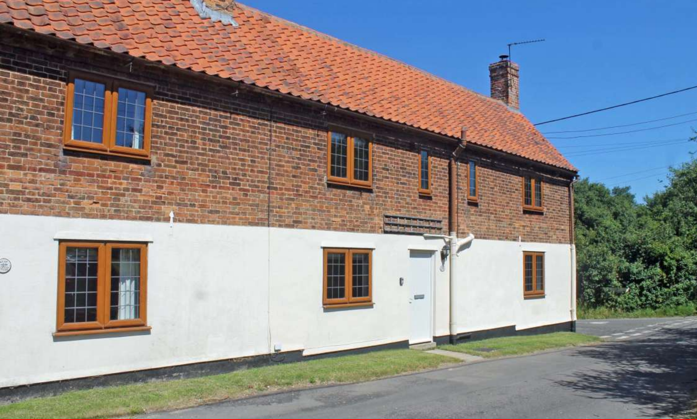
Middle Cottage, Little London

See all our properties at OnTheMarket.com