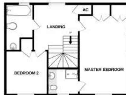
1ST FLOOR 637 sq.ft. (59.1 sq.m.) approx.