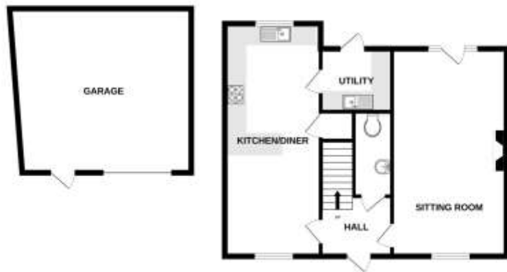
GROUND FLOOR 971 sq.ft. (90.2 sq.m.) approx.