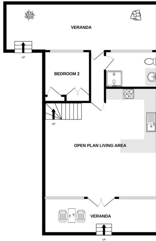
GROUND FLOOR 933 sq.ft. (86.6 sq.m.) approx.