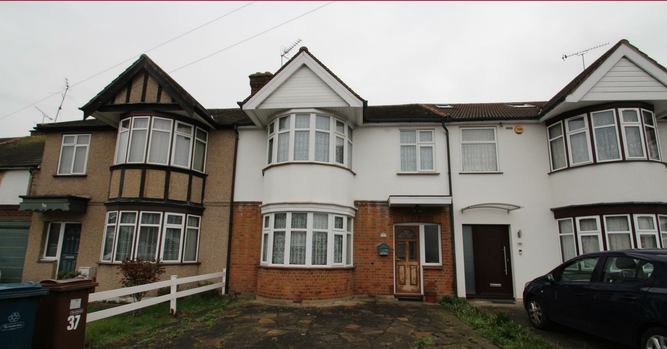
37 Brampton Grove , Harrow, HA3 8LD Auction Guide £480,000