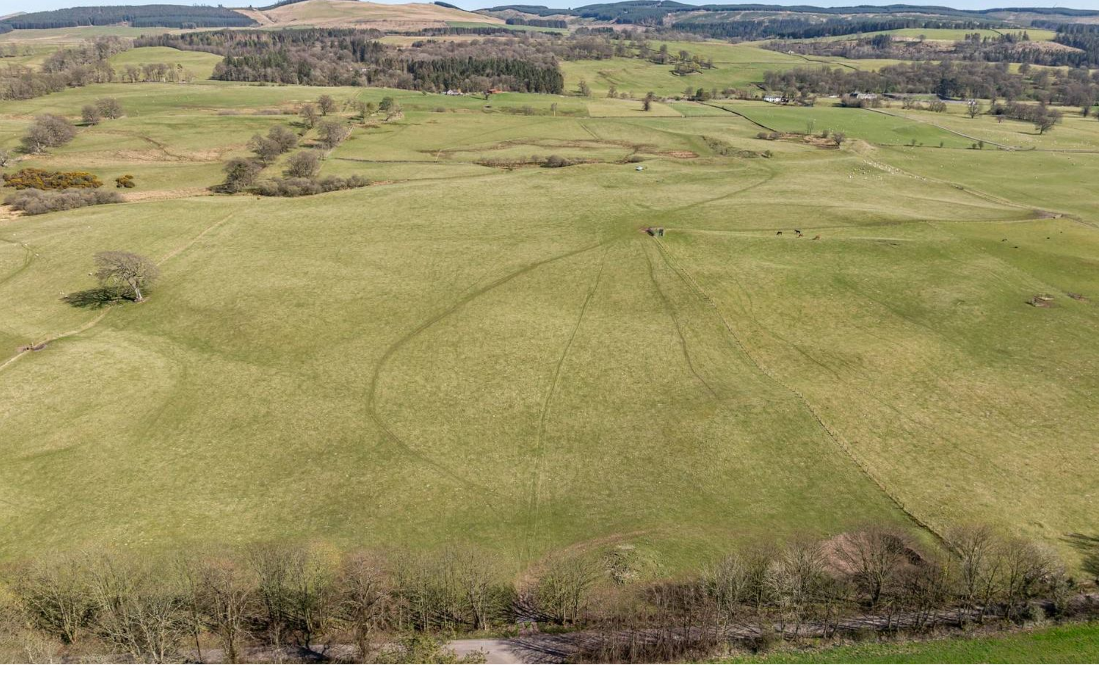
Land at Townpark, Closeburn, Thornhill, DG3 5HH Offers Over £500,000