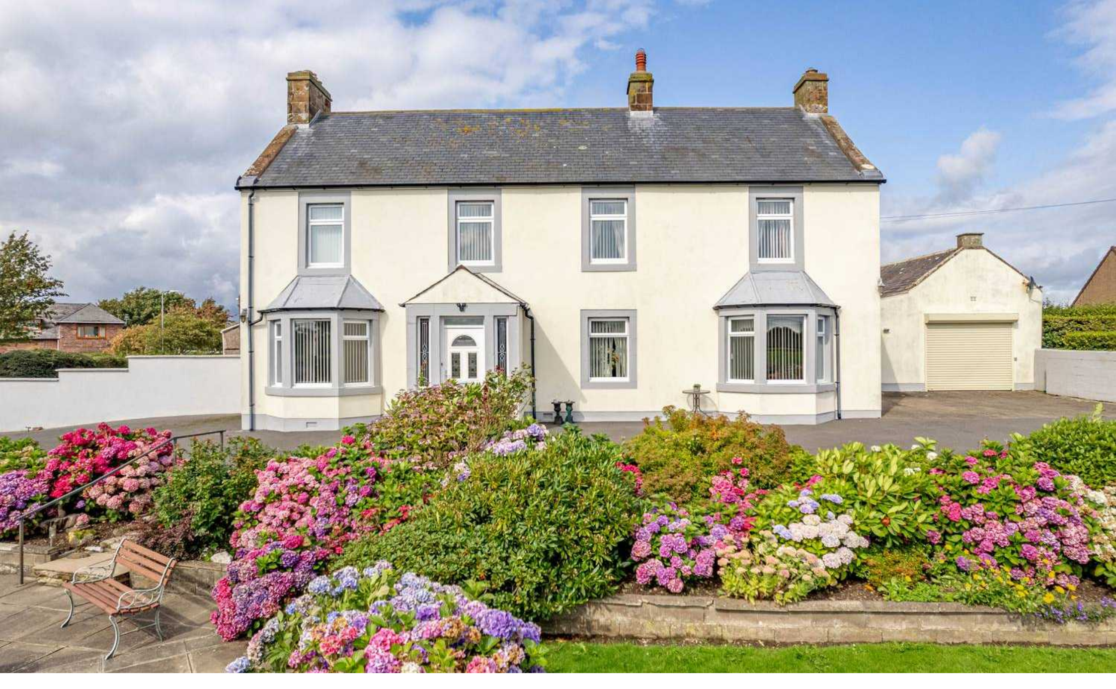
The Grange, Eastriggs, DG12