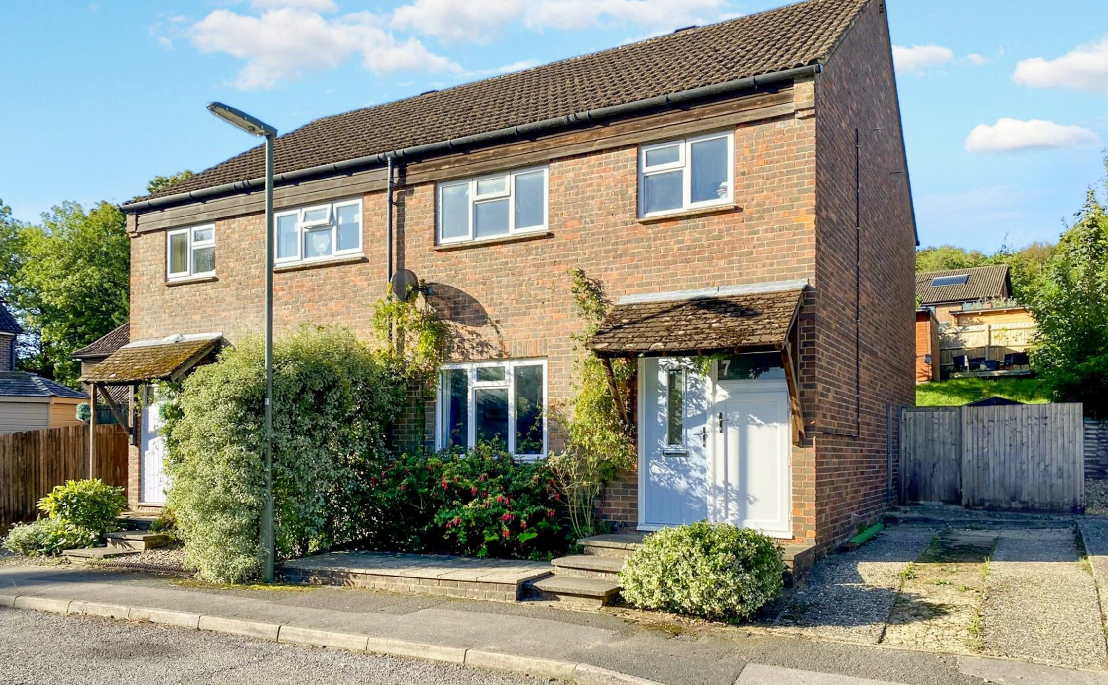
Tulip House, 7 Williamson Close, Grayswood, GU27 2DA Freehold