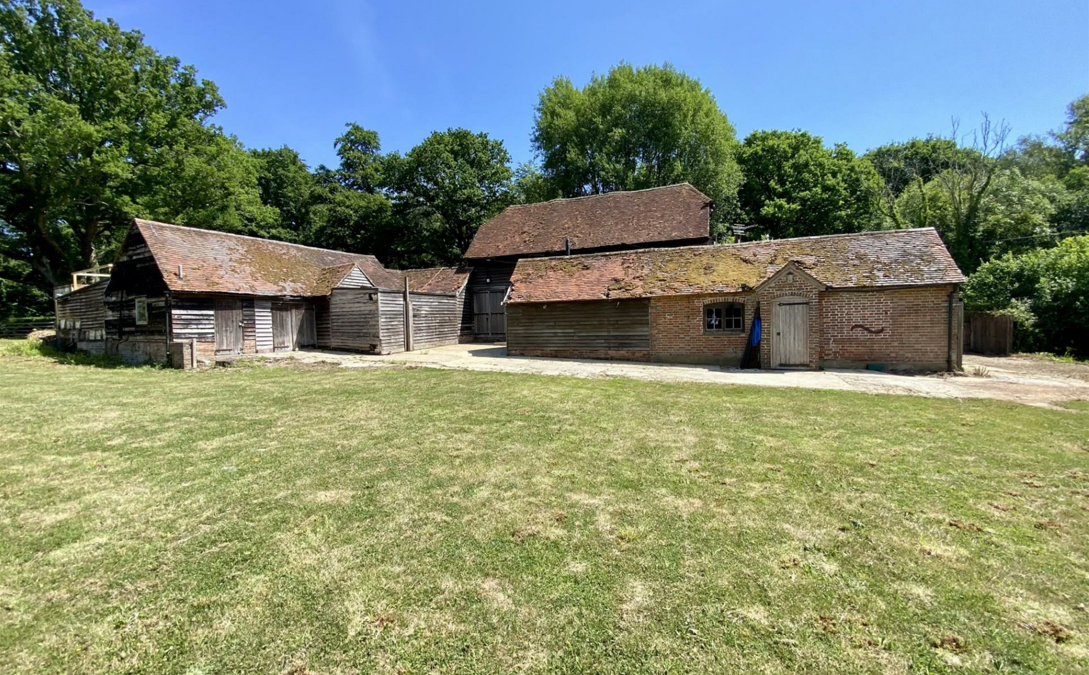
Tappers Barn, Jobsons Lane, Lurgashall GU28 9HA Price Guide £675,000