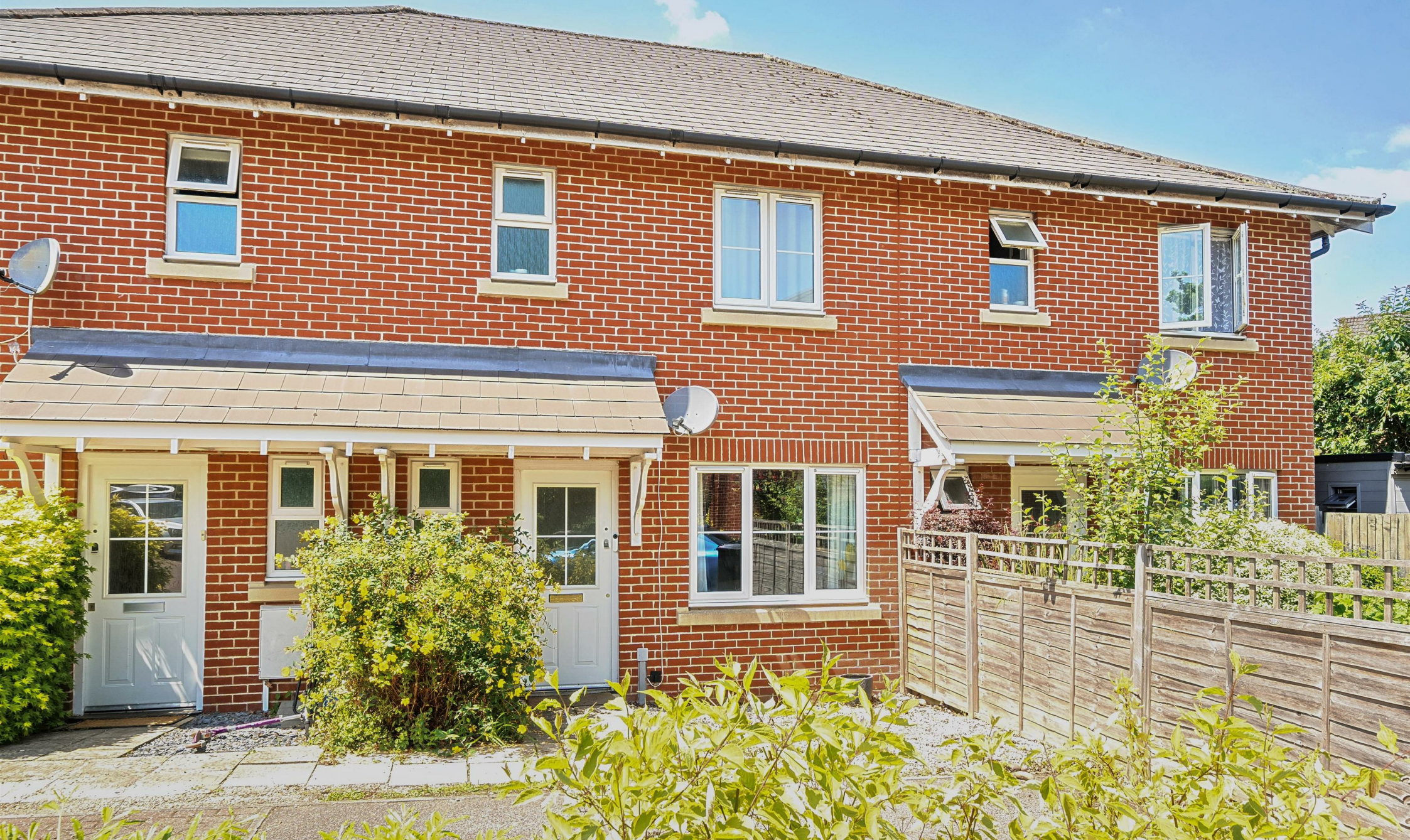
Wey Gardens, Camelsdale, Haslemere, Surrey Freehold