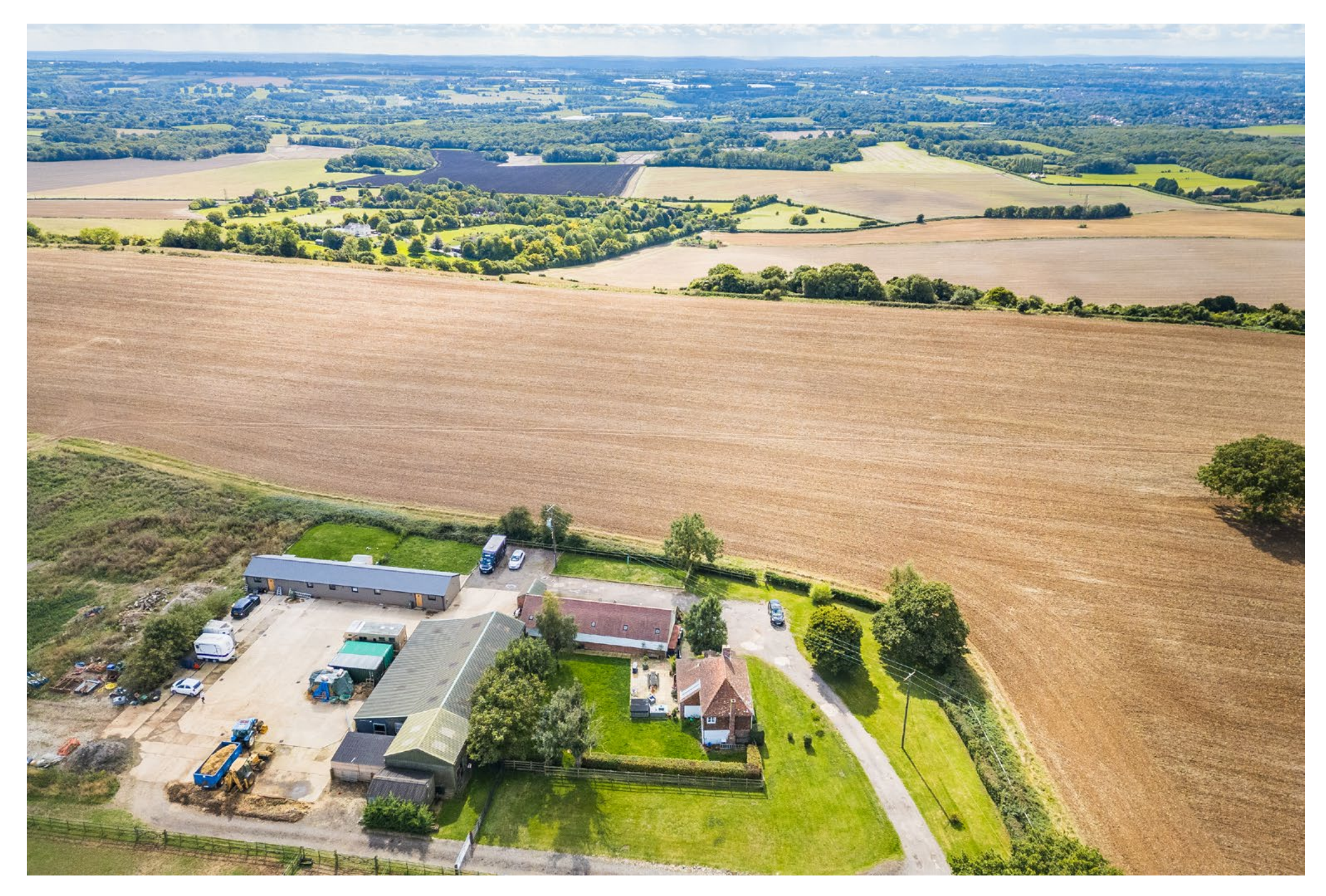
LAMBERT & FOSTER | SCRAGGED OAK FARM, HUCKING