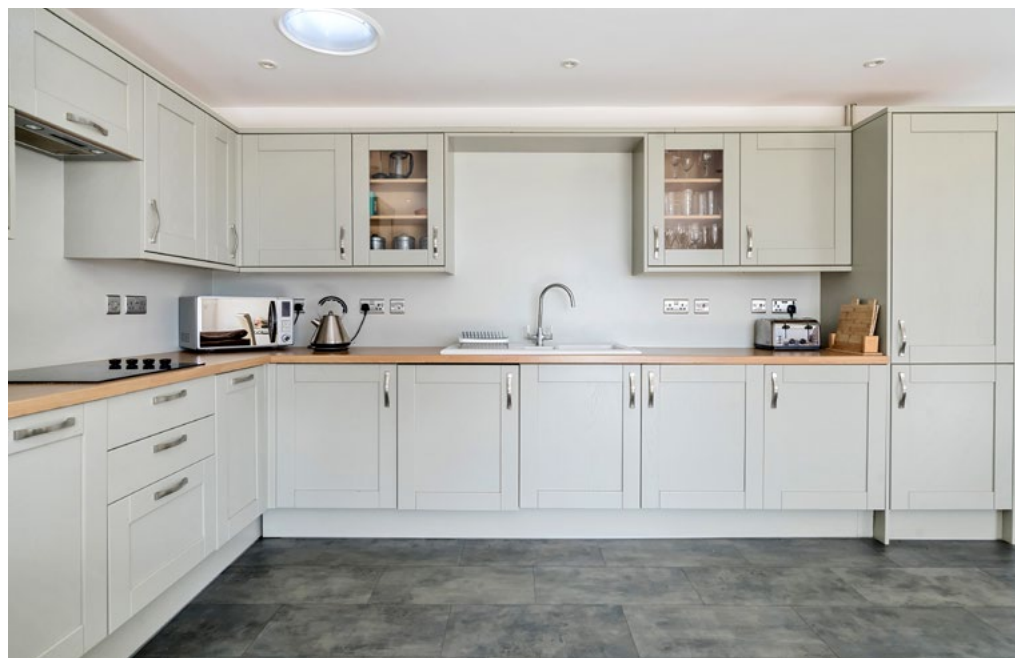
LAMBERT & FOSTER | SCRAGGED OAK FARM, HUCKING