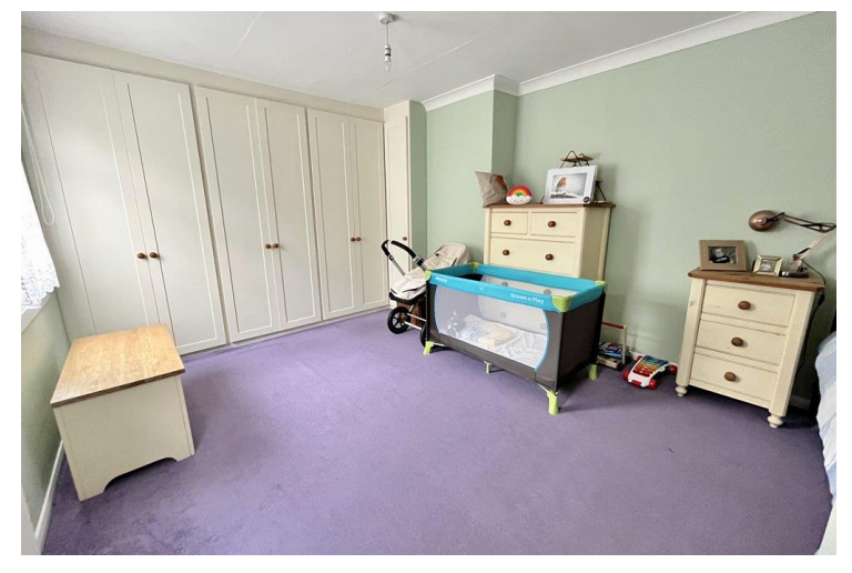
IMPORTANT NOTICE: Lambert & Foster themselves and the vendors and/or lessors of this property whose agents they are, give notice that: The particulars are set out as a general outline only for guidance and do not constitute part of an offer or contract. All descriptions, dimensions, references to condition and necessary permissions for the use and occupation and other details are given in good faith and are believed to be correct but any intending purchasers/lessees should not rely on them as statements or presentations of fact but satisfy themselves by inspection or otherwise as to the correctness of each of them. If there are any points which are of particular importance to you, please contact the office and we will be pleased to check the information, particularly if you are travelling some distance to view the property. In accordance with the Property Misdescriptions Act 1991, we must advise that we have not tested any of the main services, various electrical or gas appliances and fixtures which may be referred to in these sales particulars. Any prospective purchasers are strongly advised to satisfy themselves that such are in working order. No person in the employment of the Agents has any authority to make or give any representations or warranty whatever in relation to this property. In accordance with Money Laundering Regulations, we are now required to obtain proof of identification for all purchasers. Lambert & Foster employs the services of Smartsearch to verify the identity and address of purchaser.