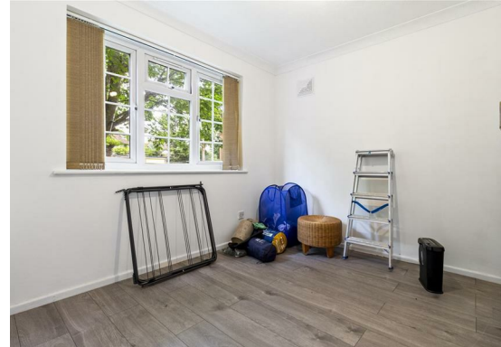
Bedroom one 10'7 x 9'9 (3.23m x 2.97m)