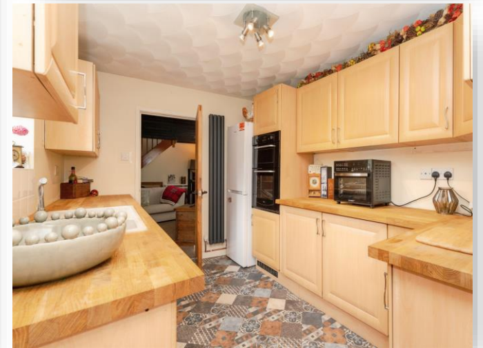
Long Yard, Briston Melton Constable NR24 2LB