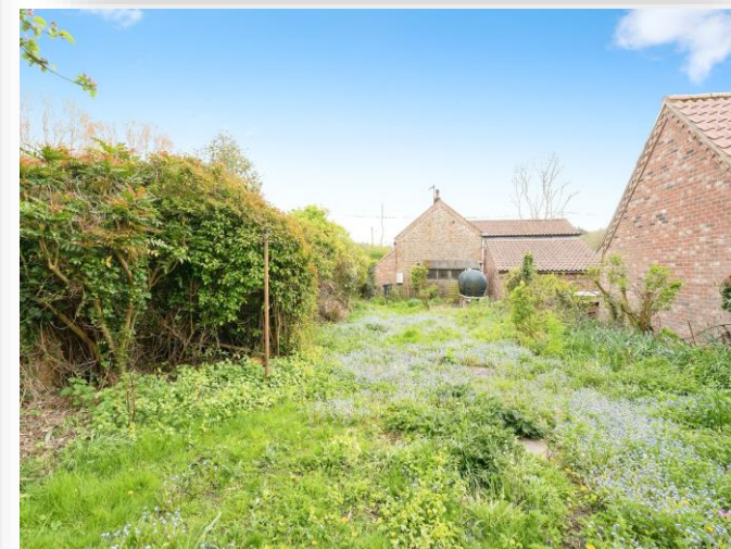
4 Marlpit Cottages Marlpit Lane, Hempstead Holt NR25 6TR