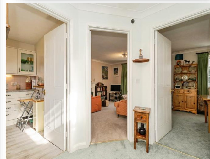
The Beeches, HOLT NR25 6AU