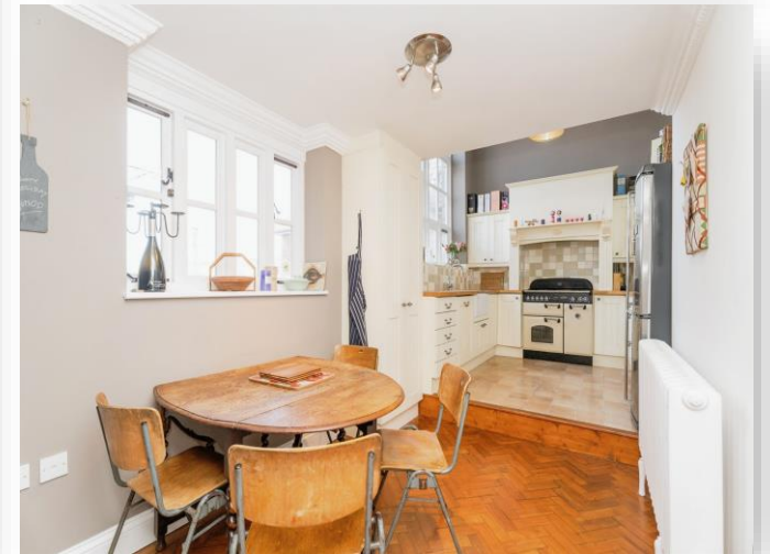
Melton Mews, Melton Constable NR24 2DP