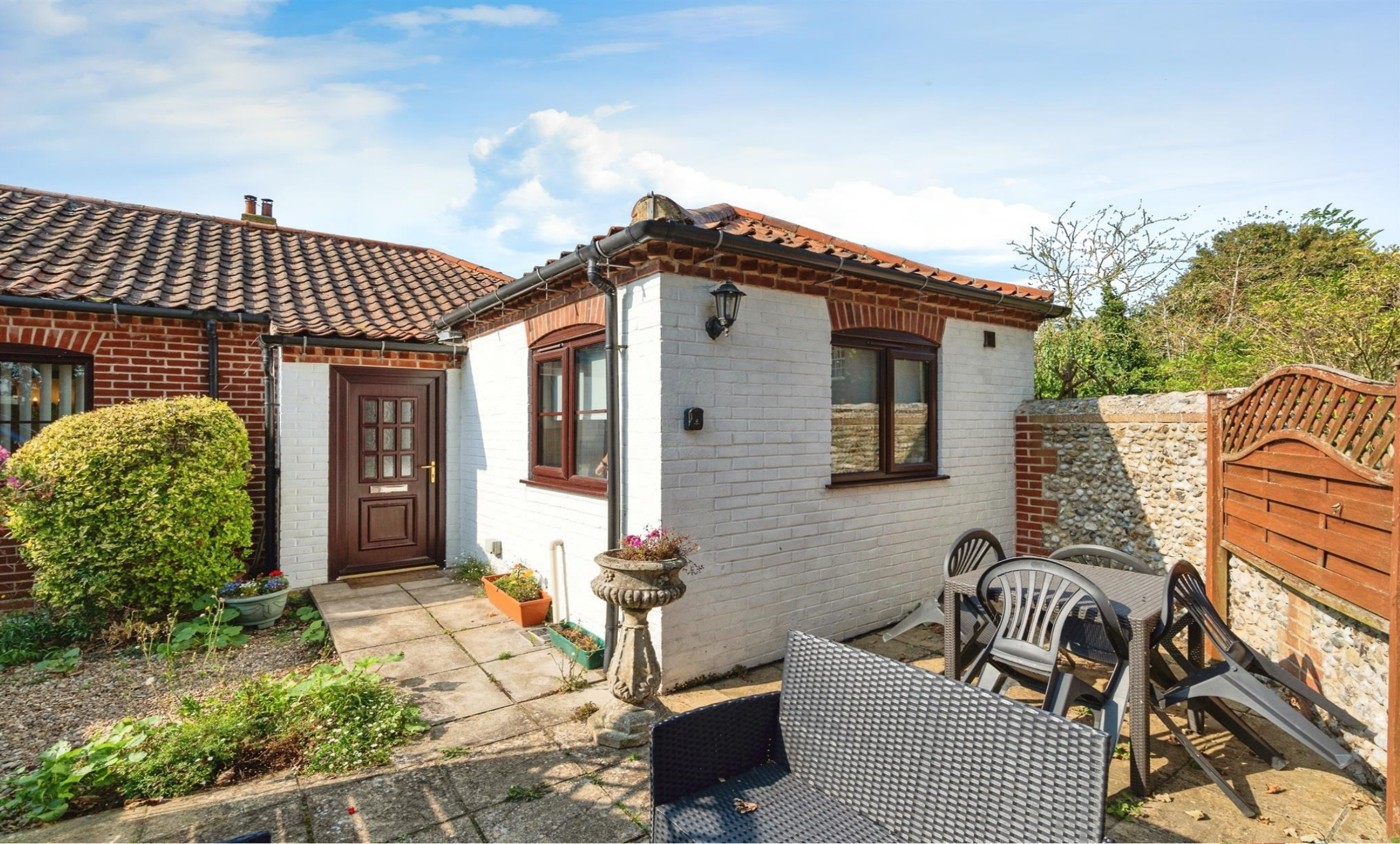
Gulls Nest The Street, Morston Holt NR25 7AA