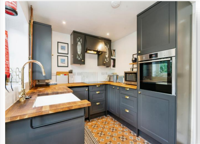
Pond Cottages Guist Bottom Road,Stibbard Fakenham NR21 0AQ