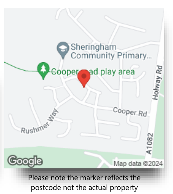
view this property online williamhbrown.co.uk/Property/HOL105359