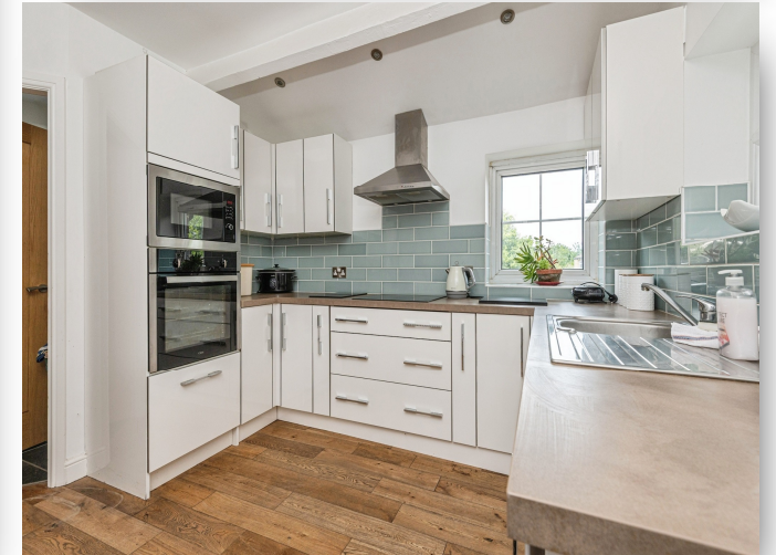
Station Road, Skelmanthorpe Huddersfield HD8 9AU