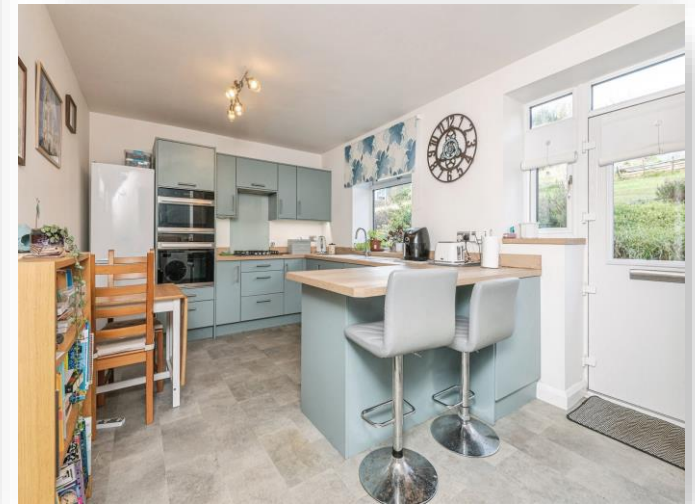
Fairfields Road, Holmbridge Holmfirth HD9 2NP