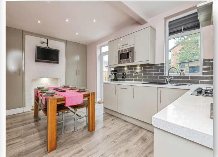
Smithy Lane, Skelmanthorpe HUDDERSFIELD HD8 9DF