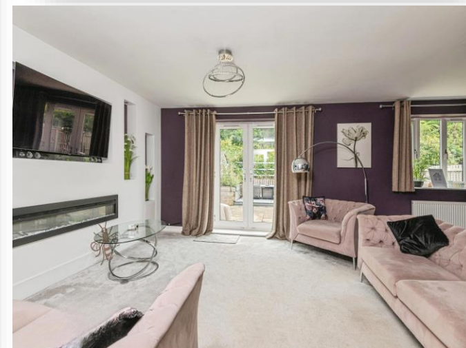
The Cutting, Brockholes Holmfirth HD9 7HL