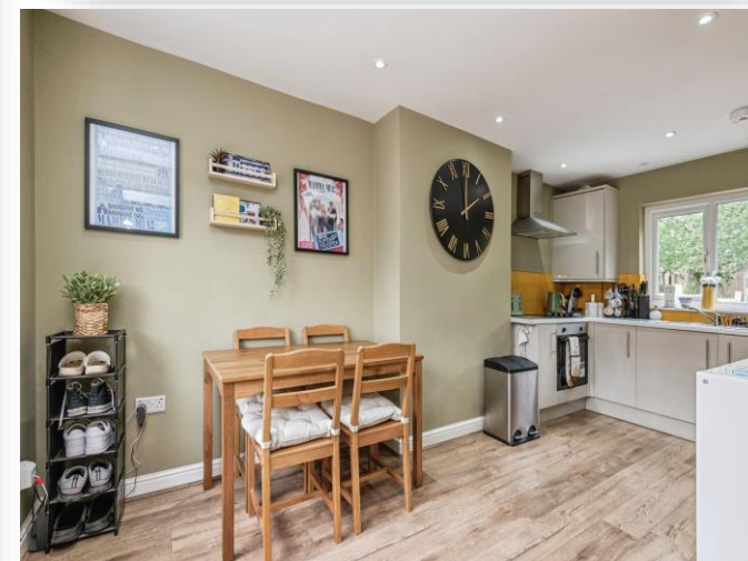
Royds Drive, New Mill HOLMFIRTH HD9 1LH