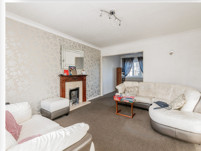
Broomfield Close, Emley Huddersfield HD8 9SG