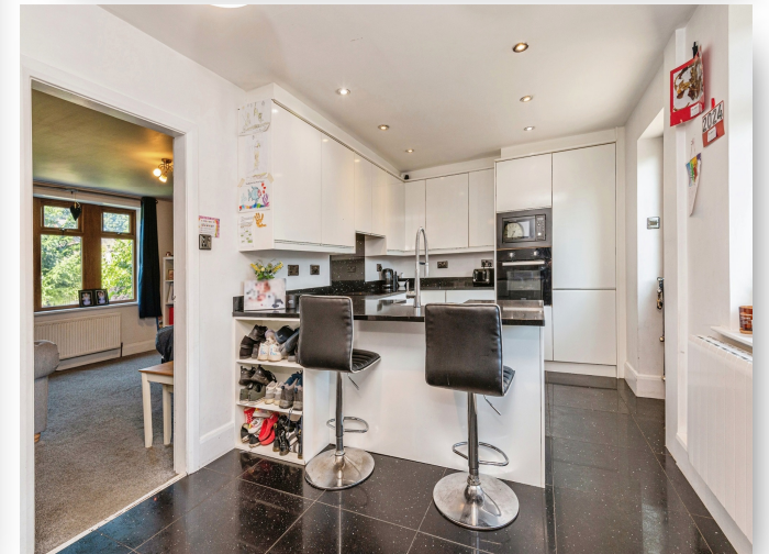
Council Terrace, Honley HOLMFIRTH HD9 6JX