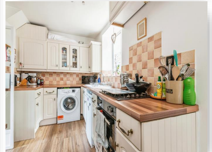
Back Lane, HOLMFIRTH HD9 1HG