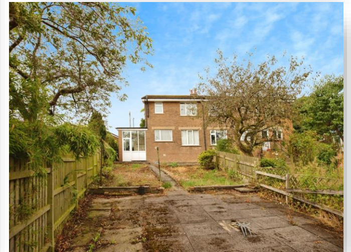
Marsh Hall Lane, Thurstonland Huddersfield HD4 6XD