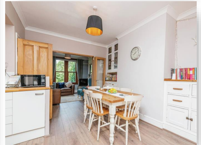
Chapel Hill, Clayton West Huddersfield HD8 9HA