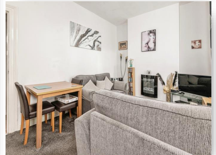
Wessenden Head Road, Meltham Holmfirth HD9 4EU