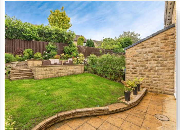
Elder Mews, Shelley HUDDERSFIELD HD8 8JU