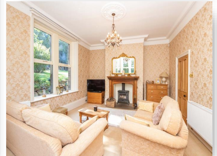
Lane Head Road, Shepley Huddersfield HD8 8BW