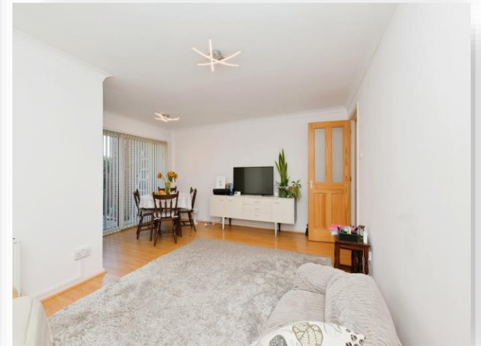
Shakespeare Court Chaucer Way, Hoddesdon EN11 9QS