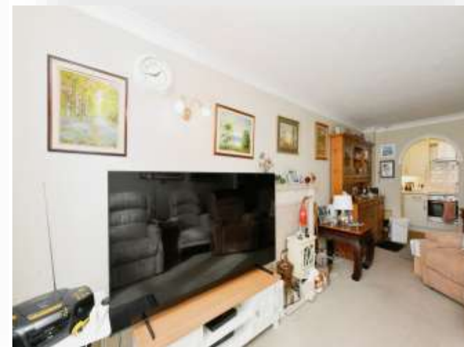
Belvedere Court High Street, Hoddesdon EN11 8UX