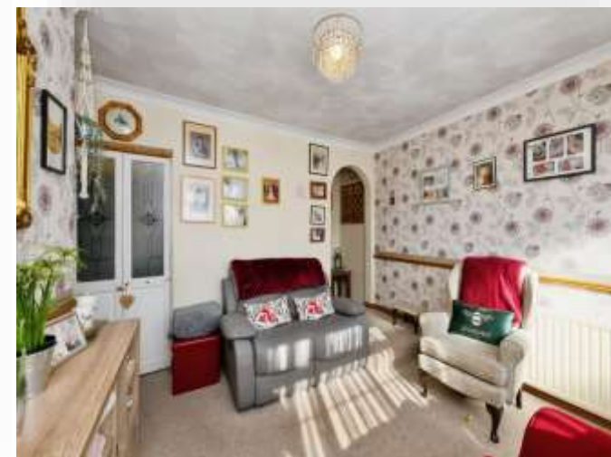
Rye Road, Hoddesdon EN11 0HR