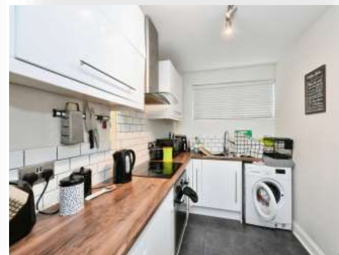
Brunswick Court Rawdon Drive, Hoddesdon EN11 8DH