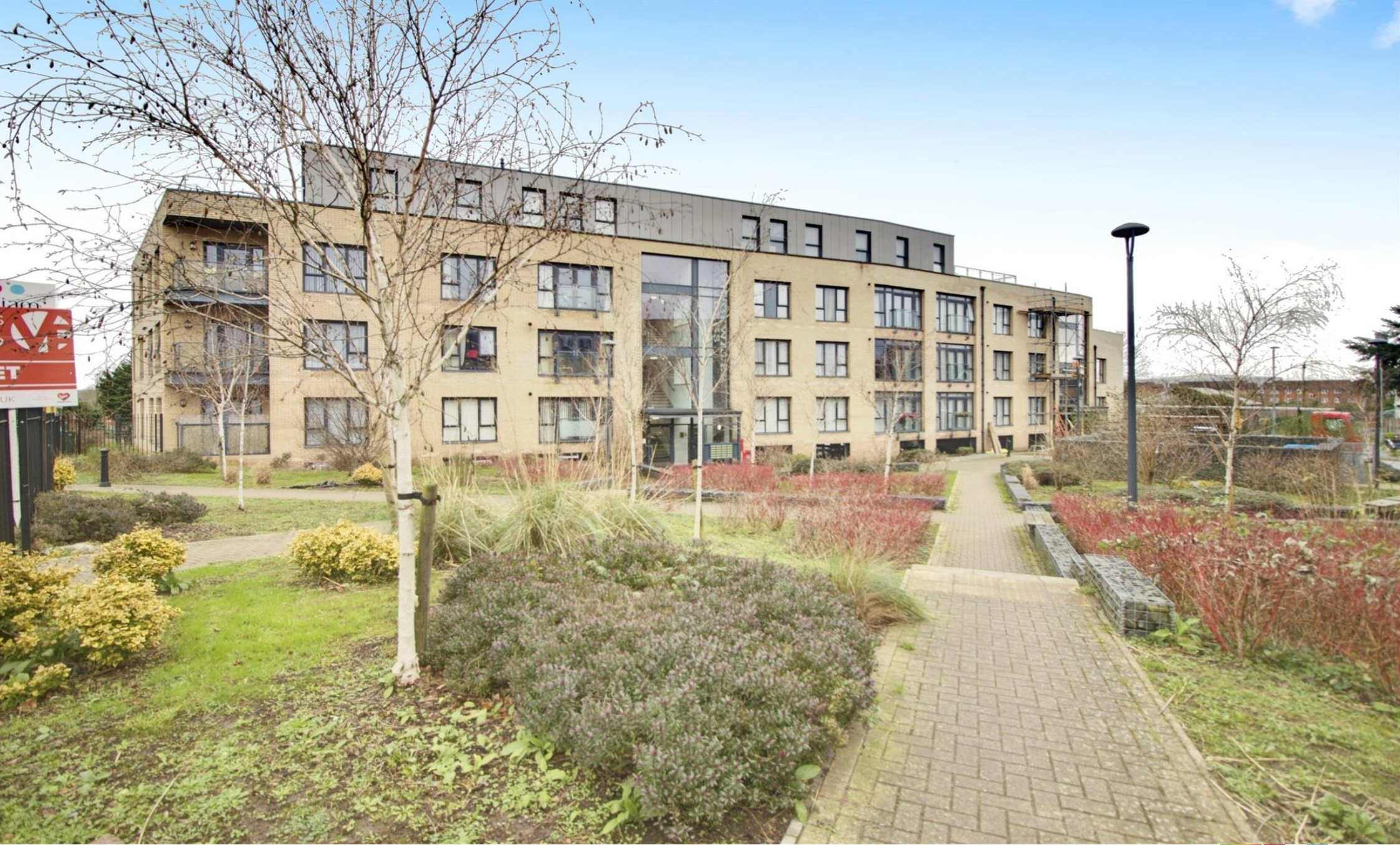
Bridgewater Gardens, Hoddesdon EN11 0FG