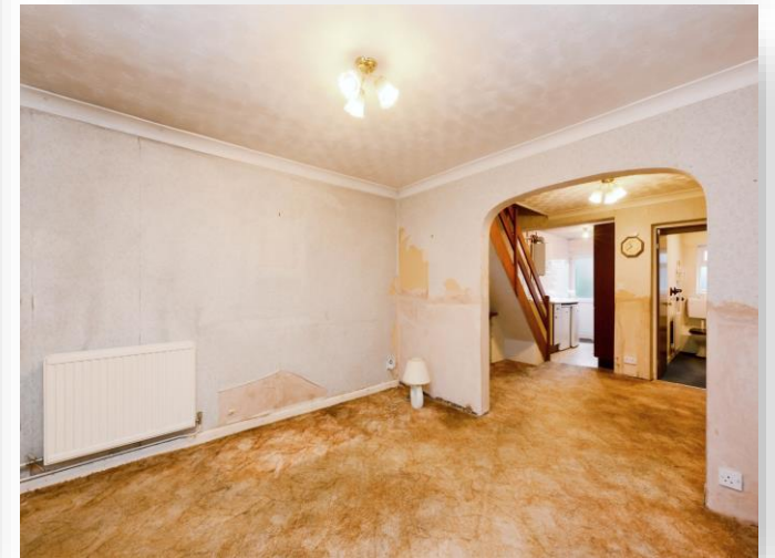
Rye Road, Hoddesdon EN11 0HP