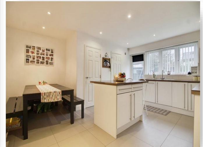
Parkfields, Roydon Harlow CM19 5JA