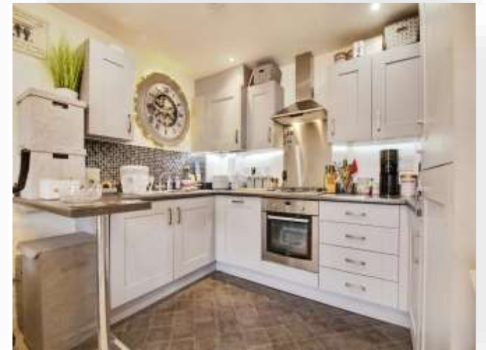
Woollens Grove, Hoddesdon EN11 9DT