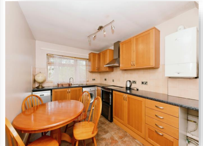
Andrews Lane, Cheshunt Waltham Cross EN7 6LH