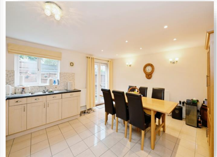
Christian Close, Hoddesdon EN11 9FF