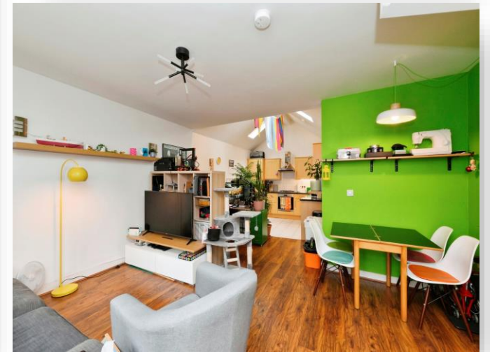
Highbourne Court Taverners Way, Hoddesdon EN11 8TW