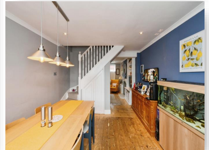
North Road, Hoddesdon EN11 8JQ