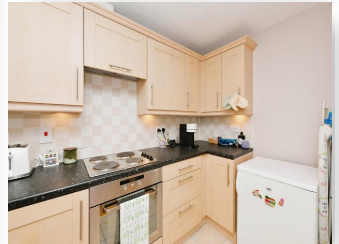
Clarence Lodge Taverners Way, Hoddesdon EN11 8TH