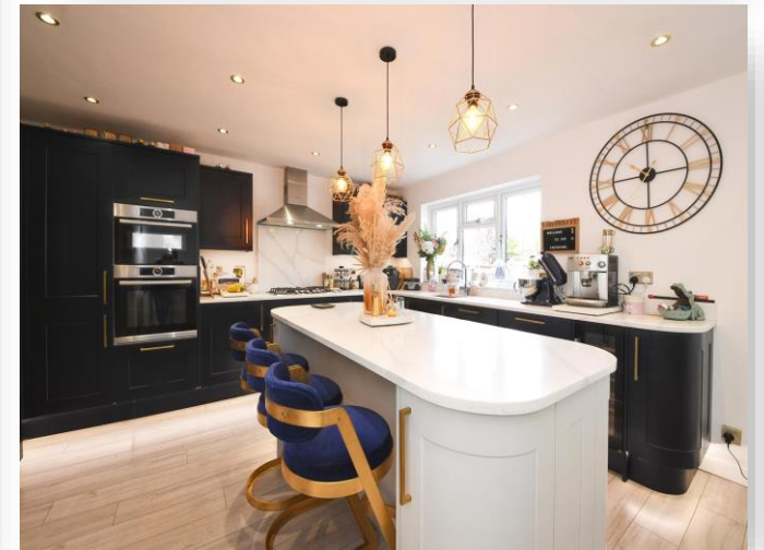
Ivydene Clyde Road, Hoddesdon EN11 0BE